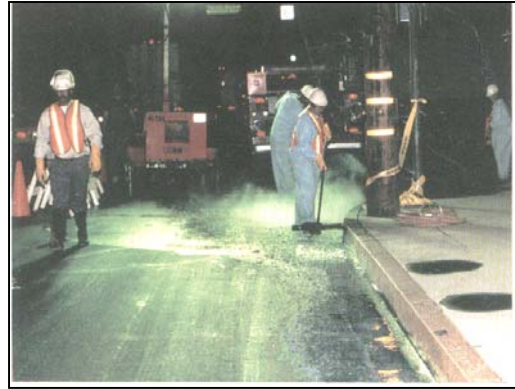
Figure 4. Hazardous Materials Technicians are responding to a site clean up in Vernon, CA.

24-hour on-call technicians are available to handle the full range of hazardous material spills including containment, substance identification, clean up, and transportation for disposal.