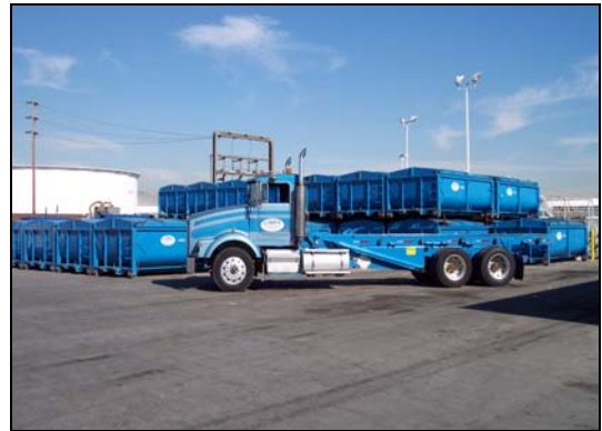
Figure 2. Featured is one of our Roll-off trucks and some of our bin inventory.