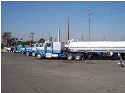
Figure 1. Sideway view of Vacuum trucks at home base in Long Beach, CA.

In 1973, O.C. VACUUM, INC. began as a full service company by offering transportation of hazardous and non-hazardous materials as its main product. Even though the company has expanded to offer many other services to fulfill the environmental needs of today, its roots lie in giving customers superior service in waste transportation.